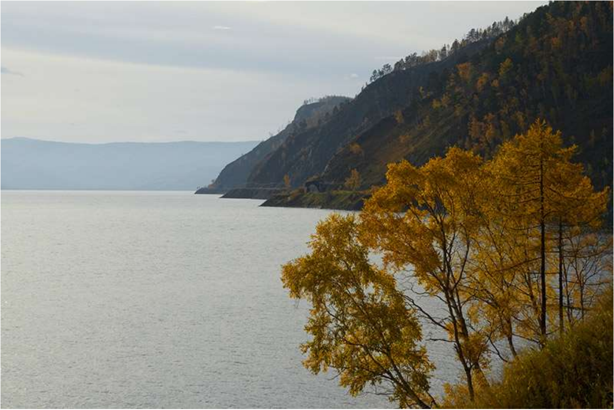
Figure 8 . Lake Baikal .

To get to the lake from the regional center is easiest by taxi or bus, which run from the bus station in Listvyanka is located in 70 km from Irkutsk on the shore of the lake near the source of the Angara.