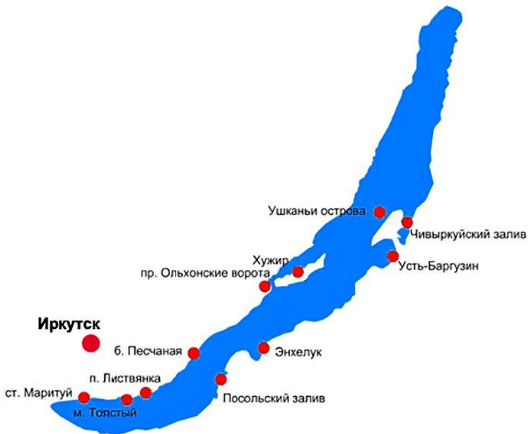
Figure 6 . Map of Lake Baikal .

The Baikal usually sunny weather. For example, during the year in the village of Bolshoye Goloustnoye is only 37 days it without the sun, and on the island of Olkhon - 48 days .